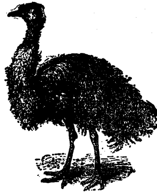
EMU M.M. BRAND